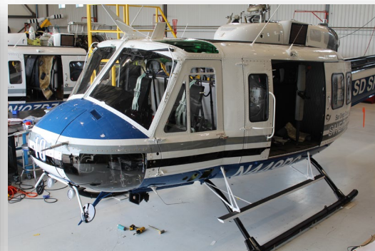
Proprietary * Confidential * Do not redistribute without express written consent of Eagle Copters Ltd.